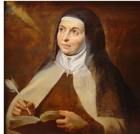
St Teresa of Avila

Accustom yourself continually to make acts of love, for they enkindle and melt the soul.