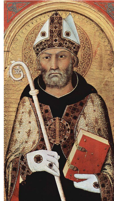
Augustine of Hippo