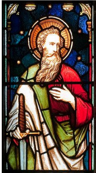
St Paul (1 Cor 13)

...these remain: faith, hope and love, the three of them; and the greatest of them is love.